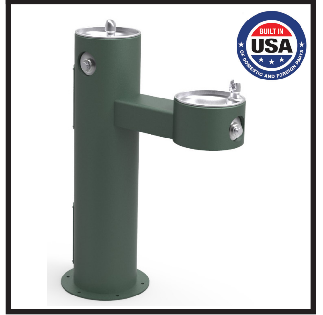
Model LK4420SFRK is shown.