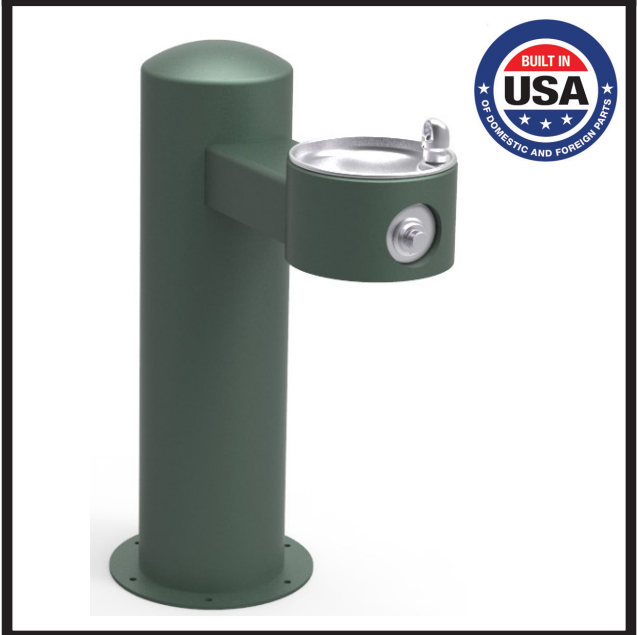
Model LK4410SFRK is shown.