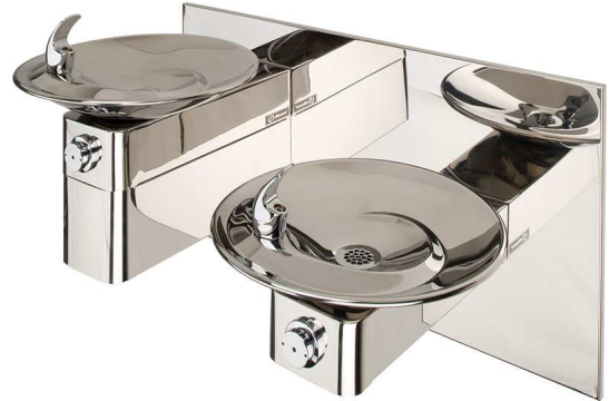
Shown mounted on 1011HPS

For more information, visit www.hawsc.com or call (888) 640-4297.