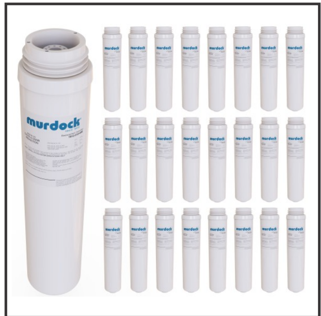
RWF1 and RWF1-24 shown

* Certification to NSF is through a third party filter manufacturer.